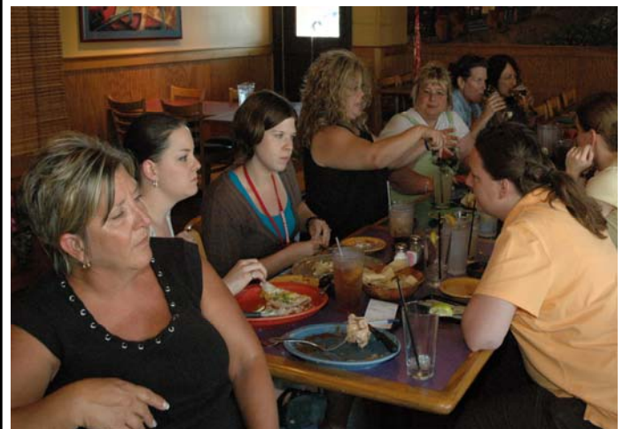
The MEA Membership Team hosting the New Teachers' Social Hour at Mi Amigo's on August 30, 2007.