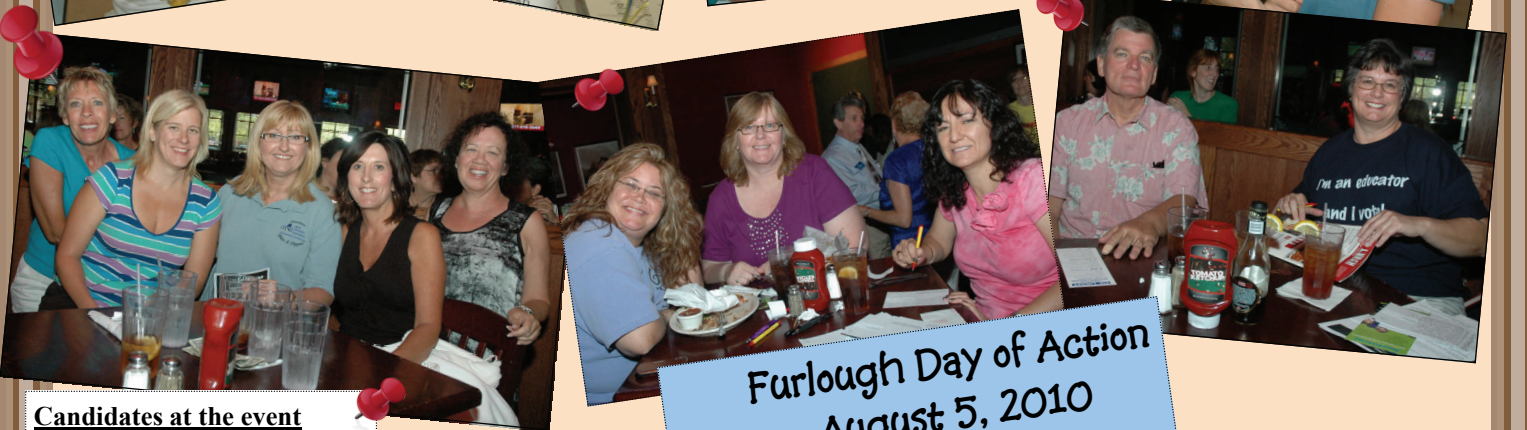
Furlough Day of Action August 5, 2010