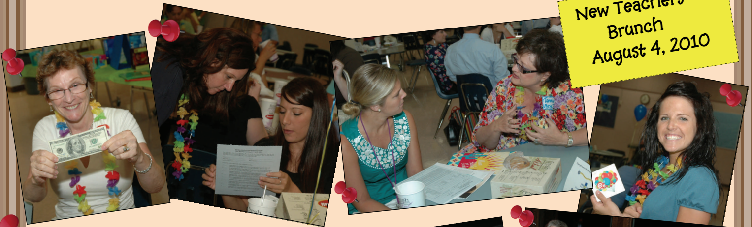
New Teachers’ Brunch August 4, 2010

Hope your summer was as rewarding and action-packed as MEA’s summer was!